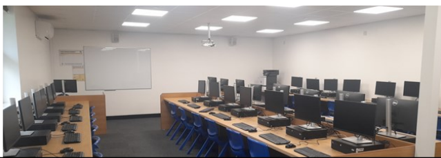
ICT1 (Eng Block)